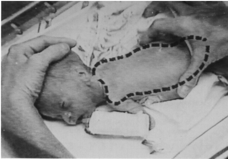
Fig. 4. Back movement: With one hand covering gently baby's head, the fingertips of the other hand stroke across the shoulders and down the sides of the baby's back, gently and lightly.