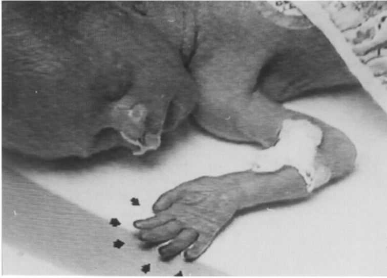
Fig. 3. Hands and fingers: With one hand holding (do not lift it) gently baby's hand, with the fingertips of the other hand stroke across the hand and each of the baby's fingers gently and lightly.