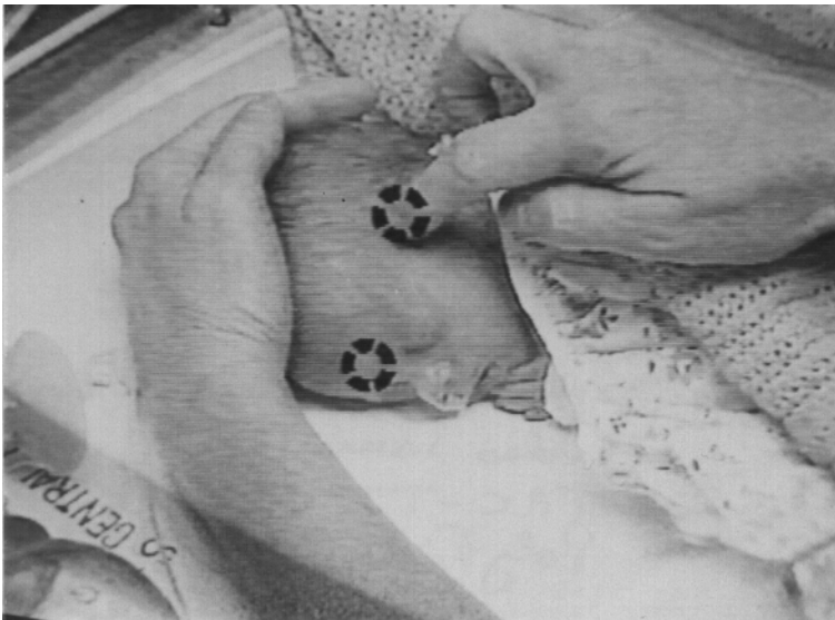
Fig. 2. Forehead and temple movements: Keeping one hand gently on the head of the baby, a finger tip of the other hand strokes, gently and lightly, between the eyebrows in a circular movement and then the side temples.